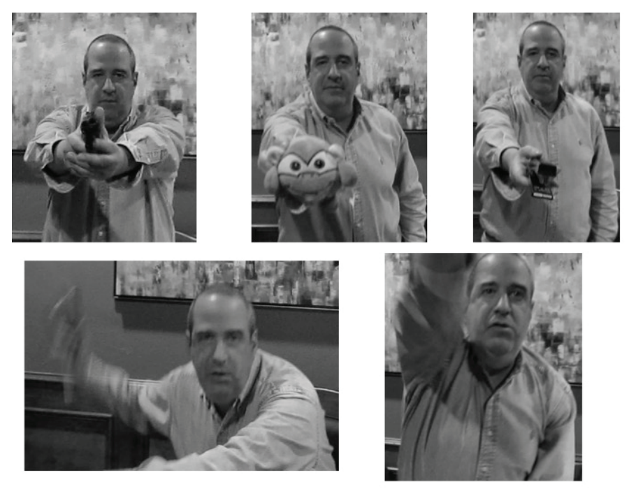
Figure 1 . Screen shots from the video conditions. Upper left: weapon; upper middle: toy; upper right: typical object and action; both lower images: typical object as weapon.

The second author recorded a video (no audio) from a first person, point of view (POV). The POV enters the house through the garage and proceeds down a hallway and into a home office. Each version of the video is identical in these respects, and a man always is seen seated at the desk in the office, facing the POV. Our manipulation involved the object with which the man is interacting, and what he does with it. In one version (typical object/action), he is seen stapling papers with a black stapler, and as the POV approaches, he stands up and hands the stapler to the POV. The second version (typical object/unusual action) also shows him stapling papers, but this time he stands up and appears to strike the POV in the head with the stapler. In the third version (unusual object) the man is playing with a toy stuffed animal, then he stands and hands it over to the POV. Our final version (weapon) shows the man sitting at the desk, then he picks up a black handgun from the desk (same size and color as stapler from other conditions), stands and points it at the POV. See Figure 1 for images from each condition. Each version ends immediately after the man stands and completes the action with the object. Each version is 25 seconds in duration, and a frontal view of the man's face is clearly visible from about 1-2 meters away for the final 7 seconds. The actor portraying the target/perpetrator was instructed to maintain a neutral expression in every condition.